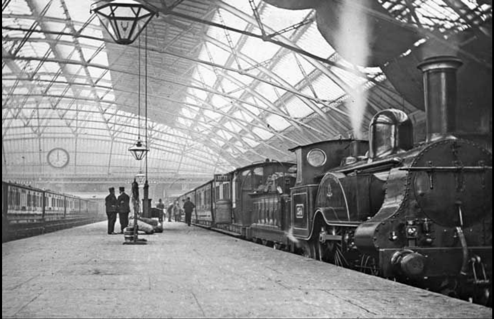
Train in Liverpool 1912