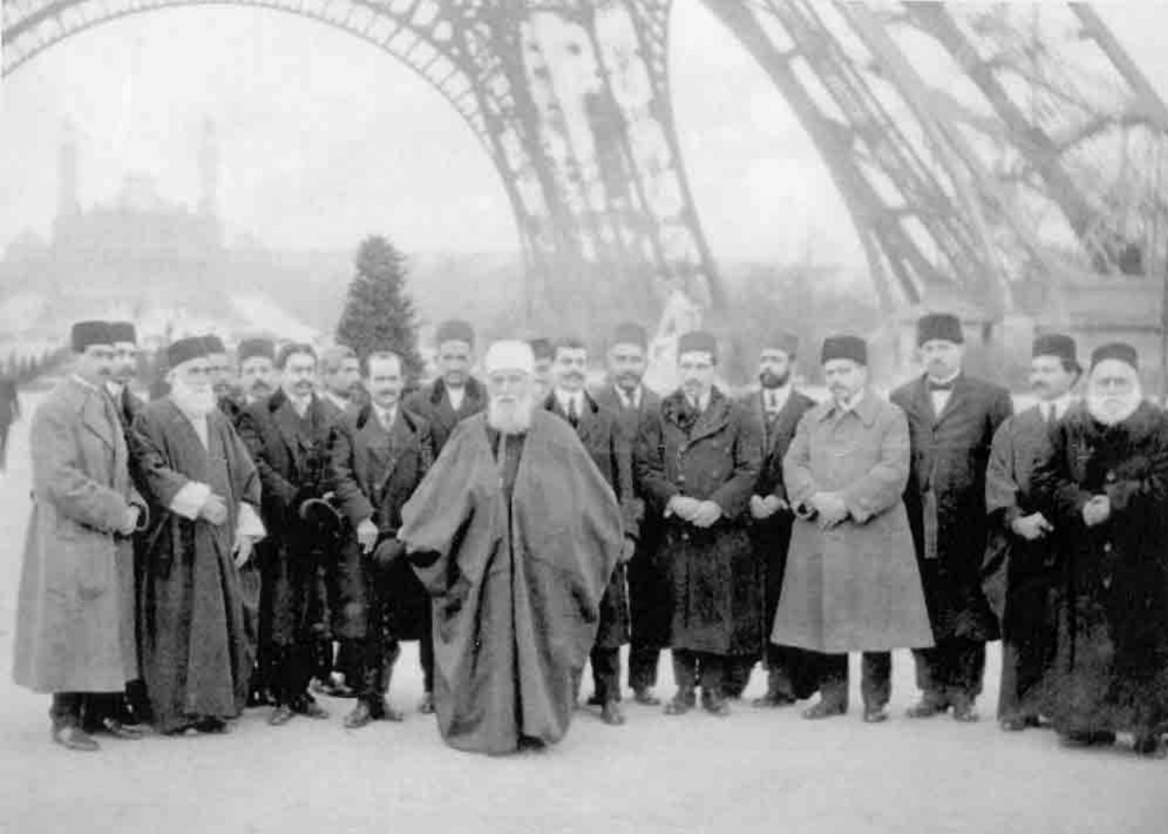
'Abdu'l-Bahá at Eiffel Tower