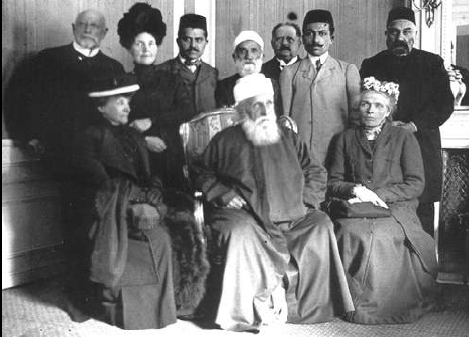
Apartment of 'Abdu'l-Bahá, 4 Avenue de Camoëns