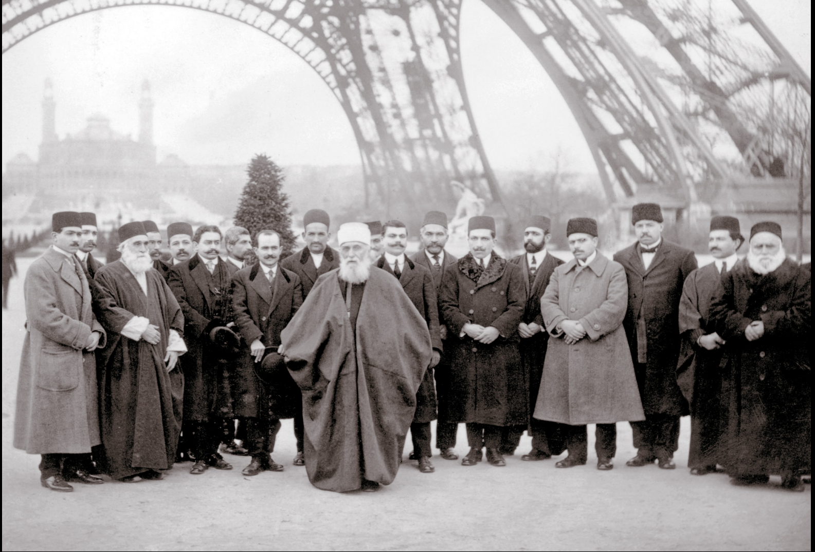
'Abdu'l-Bahá in Paris