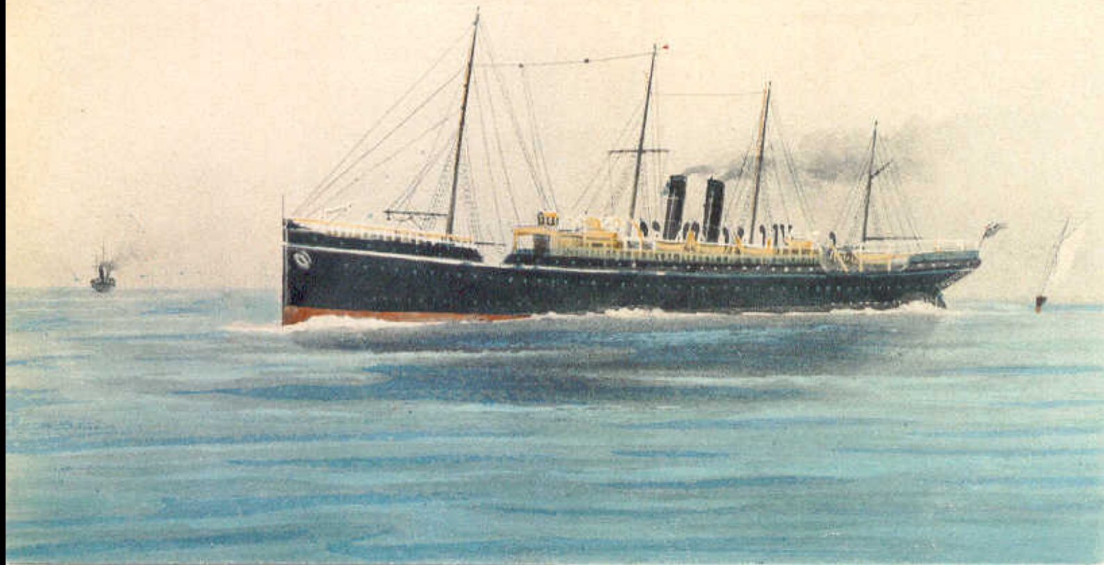
P&O steamer RMS Himalaya

Peninsular and Oriental Coy's. R. M. S. Himalaya.