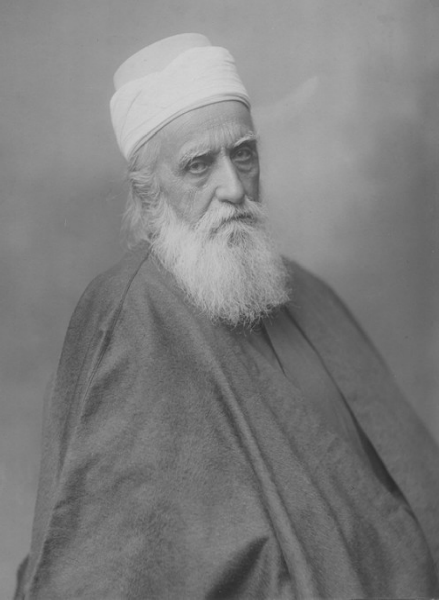
'Abdu'l- Bahá in Paris