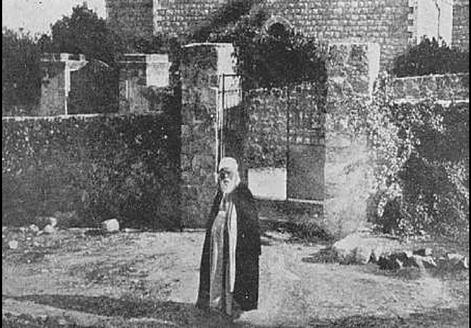
'Abdu'l-Bahá in Haifa