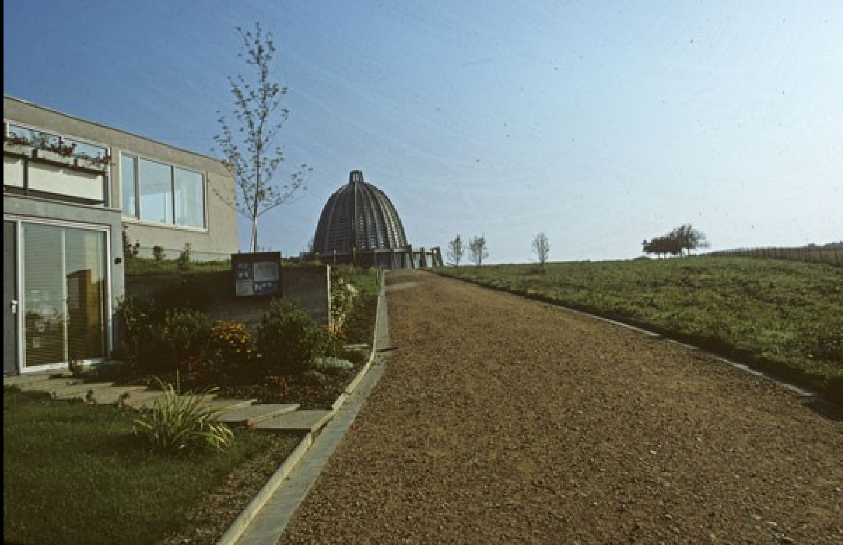
Entrance, Langenhain, Germany