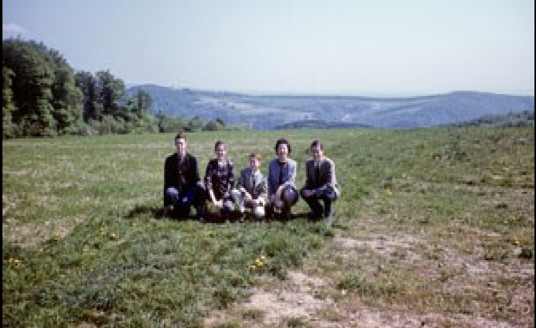
Langenhain, Germany, 1960