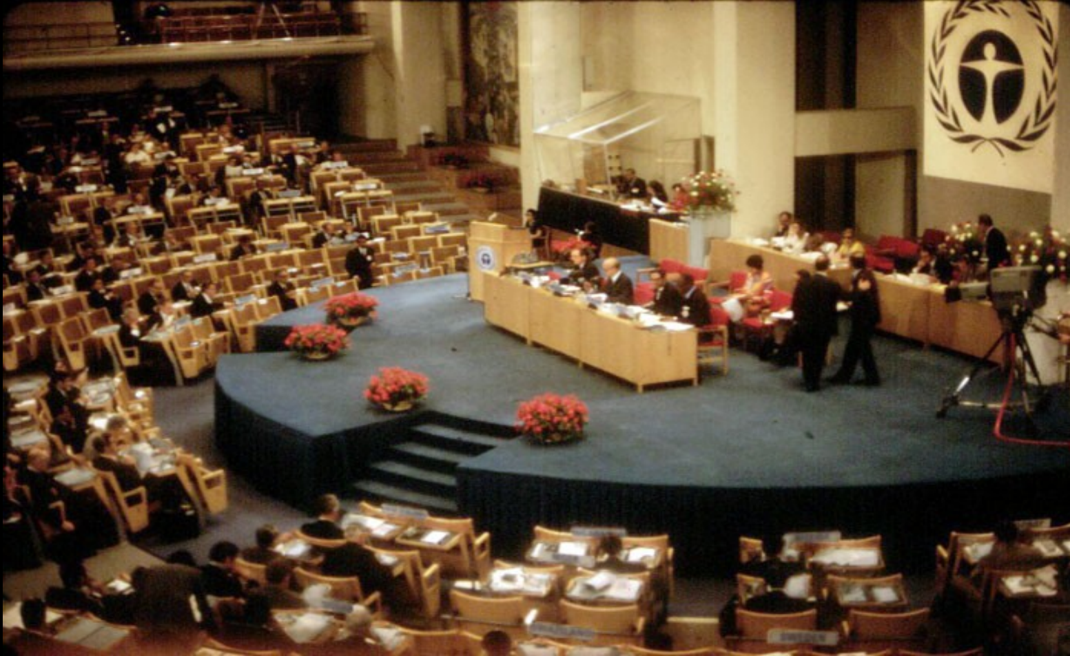
United Nations Conference on the Human Environment Stockholm 1972