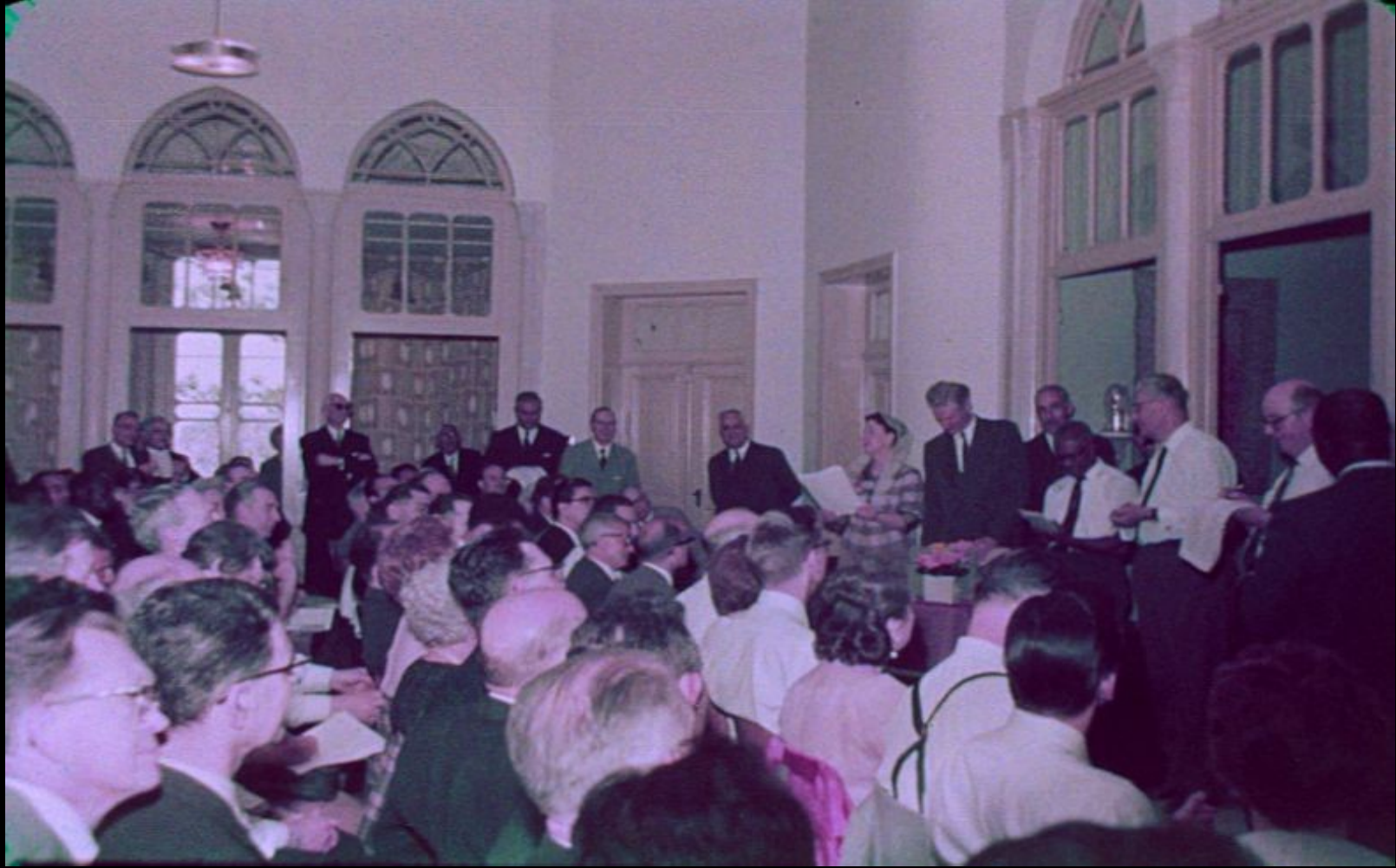
First International Bahá'í Convention, Haifa 1963 Election of the Universal House of Justice